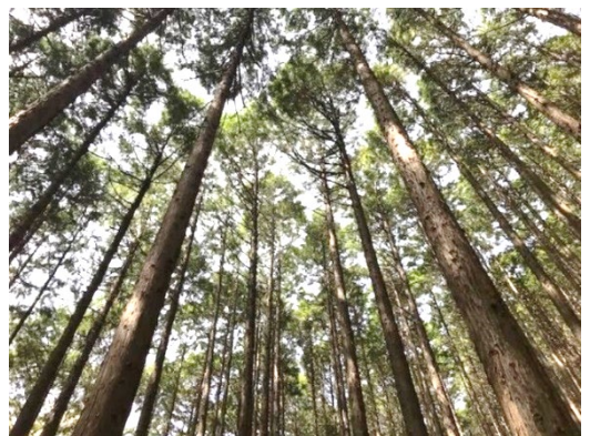
70-year-old cypress trees in Sumitomo Realty Forest

Sumitomo Realty Forest has been awarded certification for its valuable efforts in balancing between utilizing the forest as a sustainable source of timber and preserving an ecosystem that includes rare species.