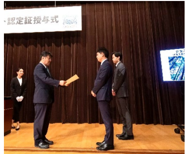
Certificate awarding ceremony