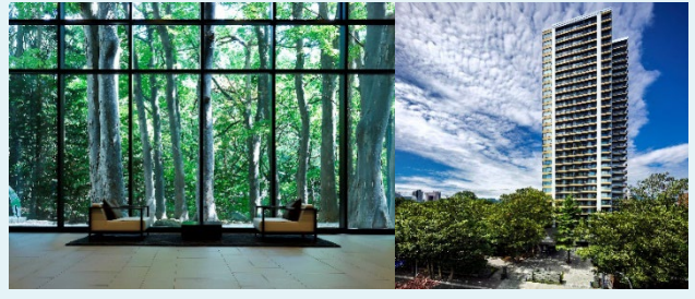
La Tour Sapporo Ito Garden

Furthermore, at IZUMI GARDEN in Roppongi, the rich greenery of the "Sumitomo Kaikan" garden, once a Sumitomo family residence and later a guest house of the Sumitomo Group, has been preserved within the redeveloped district, providing a healing landscape for people passing through the area, together with cherry blossoms lining Izumi-dori Avenue, a new attraction established through redevelopment.