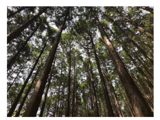
"Sumitomo Fudosan no Mori" (Sumitomo Realty Forest) 70-year-old cypress trees

Under this agreement, Susono City and Sumitomo Realty will cooperate through the cultivation of the forest owned by Sumitomo Realty, aiming at promoting sustainable and wide-area forest development in Susono City and enhancing the multifunctional roles of the forests in the surrounding areas associated with this initiative.