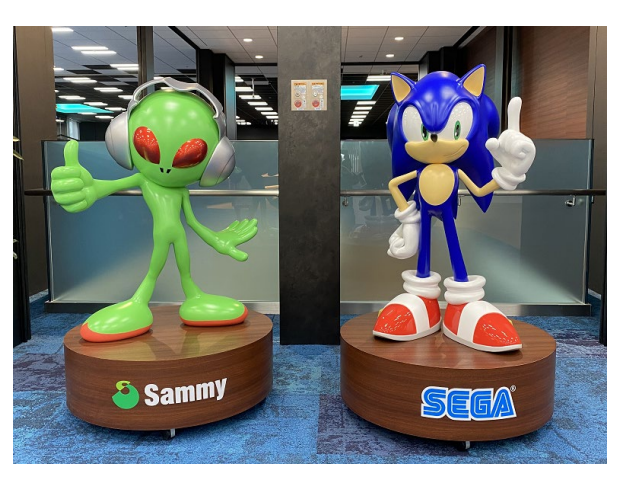
SEGA SAMMY Group character statues: ALIYAN (left) and Sonic the Hedgehog