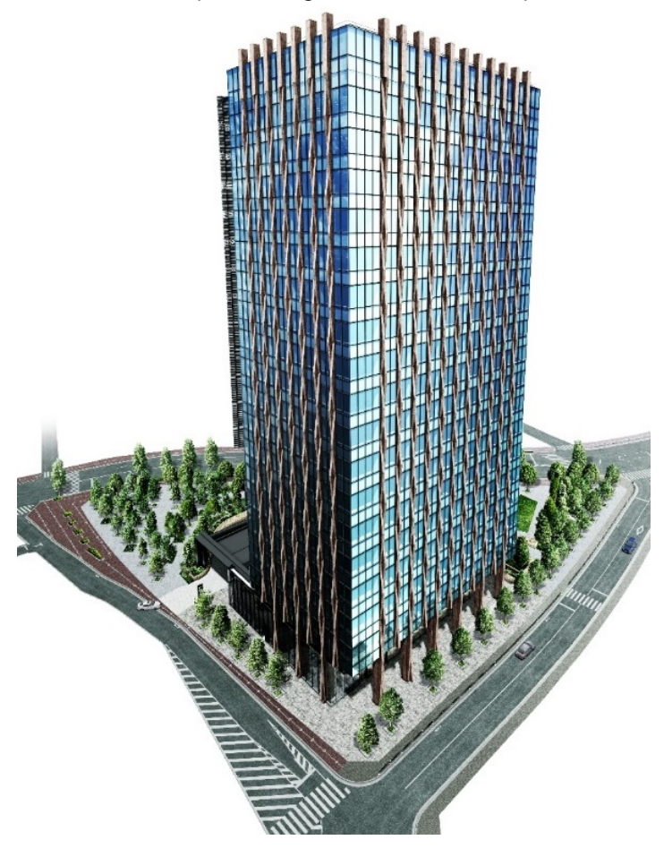
Artist's rendition of the completed building

The building is situated in the rapidly developing Osaki area of Tokyo, near Shinagawa Station (the future terminus of the linear Shinkansen) and Takanawa Gateway Station, a new station on the Yamanote Line. We anticipate strong demand for office space in this area.