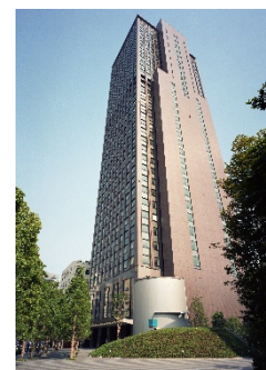
Sumitomo Fudosan Shibakoen First Building