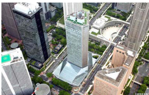
Shinjuku Sumitomo Building