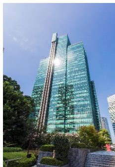
Izumi Garden Tower