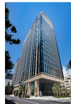
Sumitomo Fudosan Akihabara Ekimae Building