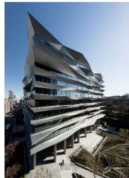
Sumitomo Fudosan Azabujuban Building