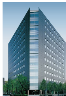
Sumitomo Fudosan Iidabashi building No.3