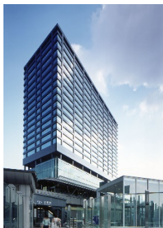
Shiodome Sumitomo Building