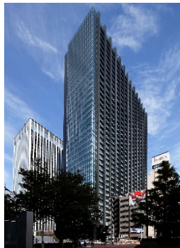
Sumitomo Fudosan Shinjuku Grand Tower