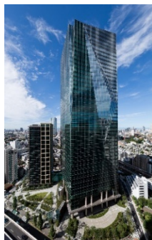
Sumitomo Fudosan Roppongi Grand Tower (4 Stars from 2018 Edition)

※Excluding Sumitomo Fudosan Roppongi Grand Tower, which received certification from 2018 edition.