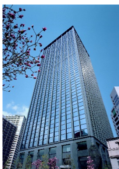
Chiyoda First Building West