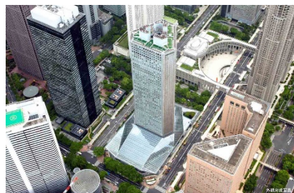
Shinjuku Sumitomo Building

The certification is granted in five grades: among the properties meeting the certification standard, which is approximately the top 20% of all domestic rental properties, five stars are awarded to the top 10% and four stars are awarded to the top 30%. (More about DBJ Green Building Certification : http://igb.jp/en/index.html )