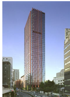
Sumitomo Fudosan Mita Twin Building West