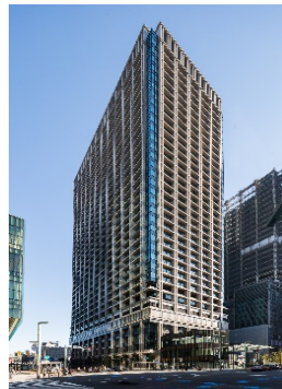
Tokyo Nihombashi Tower