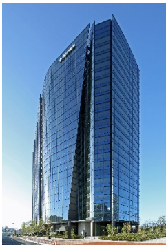
Sumitomo Fudosan Osaki Garden Tower