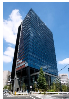
Sumitomo Fudosan Shiodome Hamariky Building

【List of Properties Certified】 *Ranks are from 2020 edition, except for Sumitomo Fudosan Roppongi Grand Tower from 2018 edition.