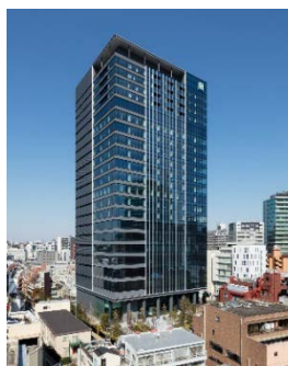
Sumitomo Fudosan Shibuya Tower