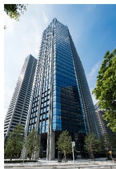
Sumitomo Fudosan Shinjuku Central Park Tower