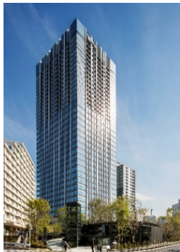
Sumitomo Fudosan Shinjuku Garden Tower