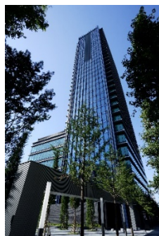
Sumitomo Fudosan Aobadai Tower