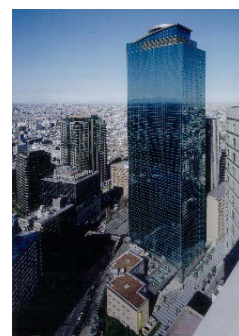
Sumitomo Fudosan Shinjuku Oak Tower