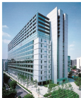
Sumitomo Fudosan Iidabashi First Building