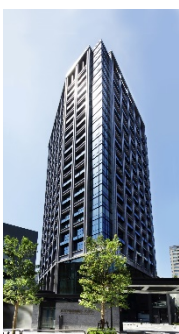
Sumitomo Fudosan Kojimachi Garden Tower