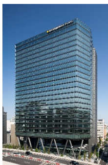
Sumitomo Fudosan Shibuya Garden Tower