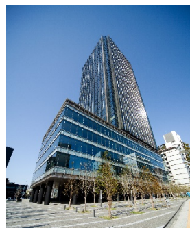
Sumitomo Fudosan Iidabashi First Tower